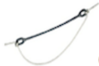
GOOD: Happy's 22' Line Snubber