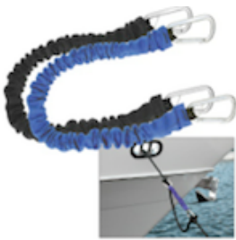
BEST: Davis Shockles Line Snubber

Snubbers: Part number DAV 1468B 22" Carbine Hooks: WIC232